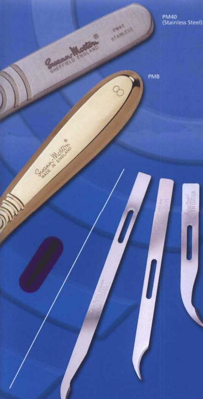
PM40 (Stainless Steel)